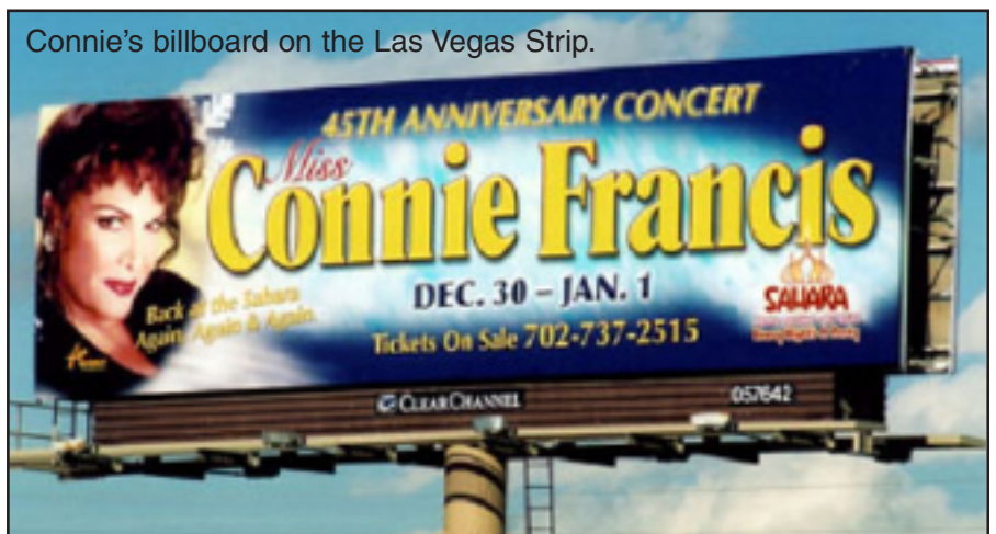
Connie's billboard on the Las Vegas Strip.

• Connie is currently writing a second autobiography, which she promises will be "startling...and have a lot of surprises, even for insiders" with information not revealed in her first book, the bestselling Who's Sorry Now?